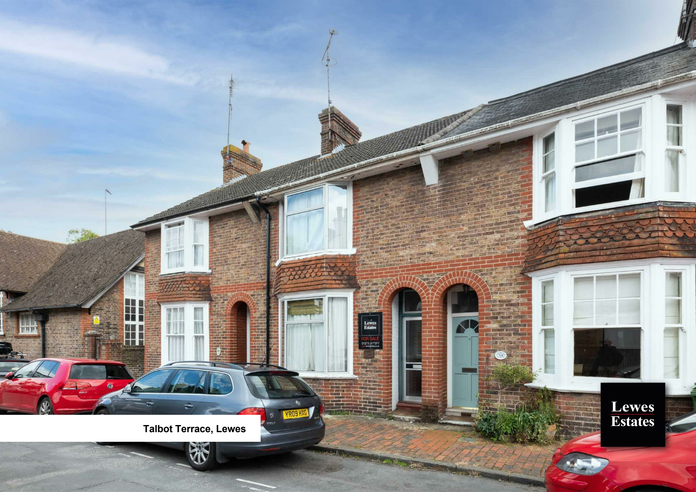
Talbot Terrace, Lewes